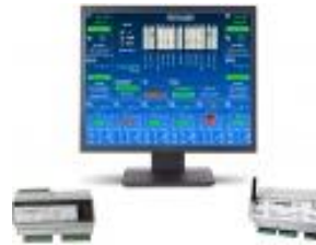
STEP II and Monitoring system

Remote buildings: life base, remote power plants AUGIER solutions are installed in more than 30 countries worldwide and have been awarded an international high reliability certifications. In addition of our free engineering, we ensure manufacturing, commissioning and training.