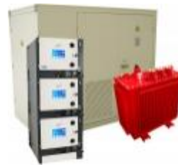
Step-up High voltage substation