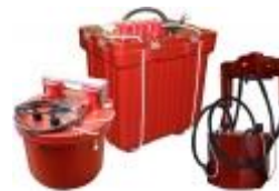
Step down Transformers 1-160kVA